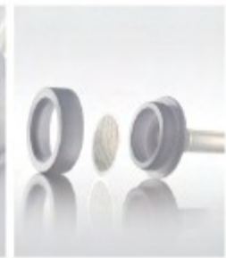
Wash bottle filter