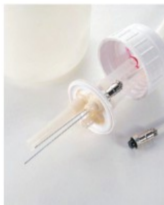
Waste water sensor