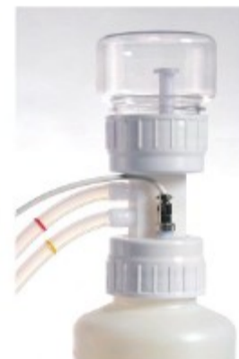
Water mist catching device