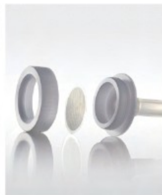
Wash bottle filter