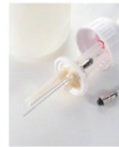
Waste water sensor